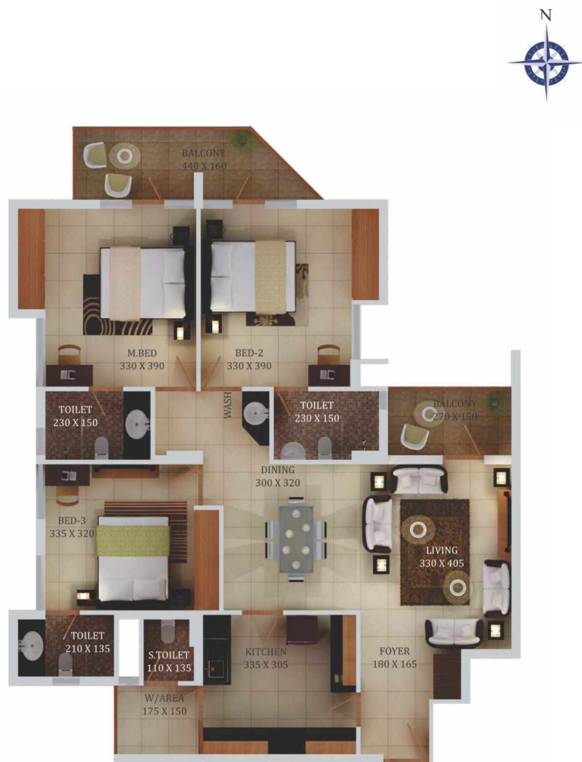
Type A1 , Super builtup area: 1555 sqft.