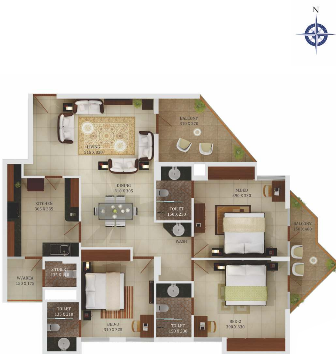
Type C , Super builtup area: 1585 sqft.