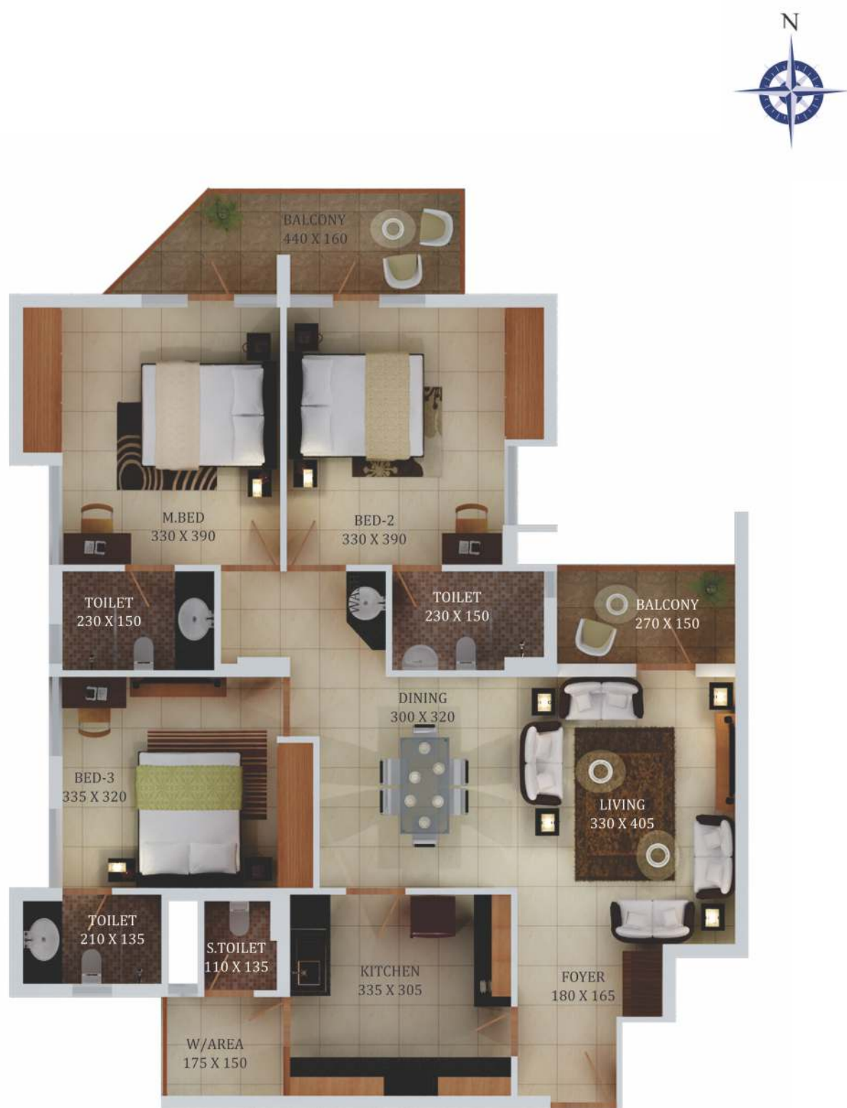
Type A , Super builtup area: 1555 sqft.