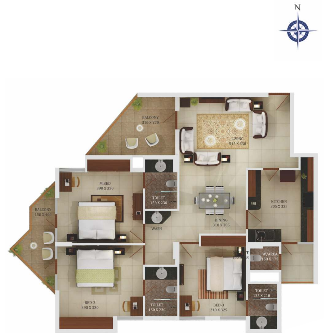
Type B , Super builtup area: 1585 sqft.