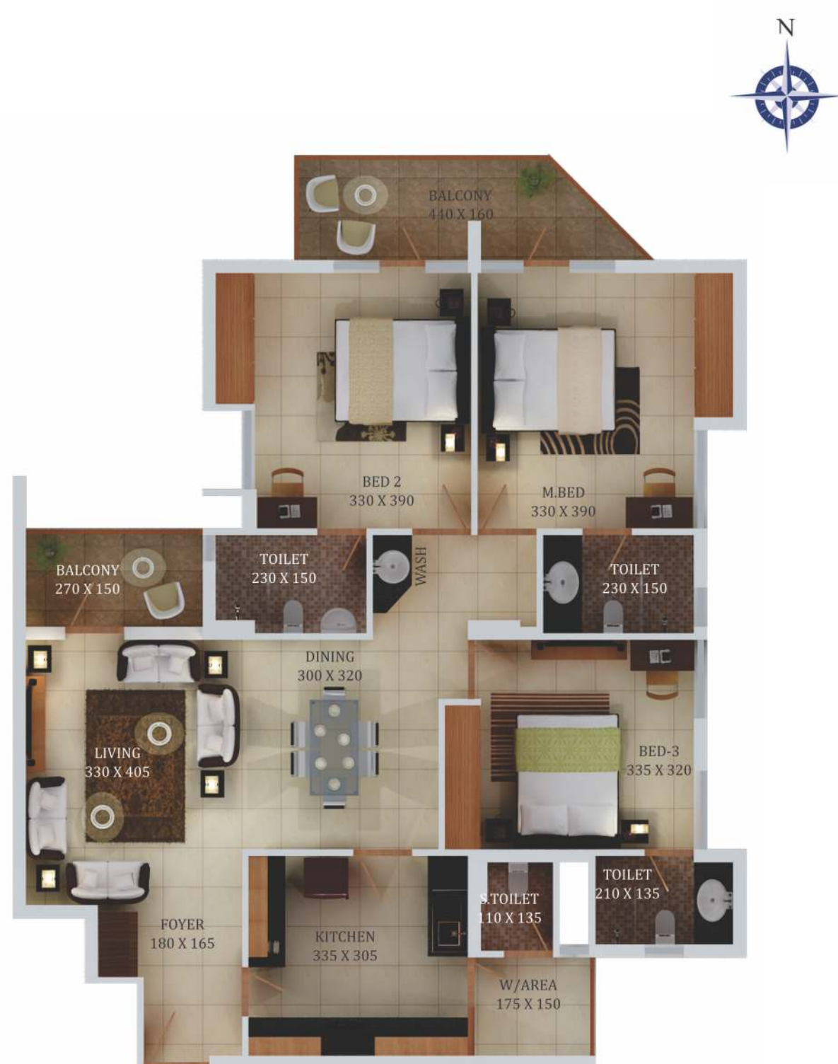
Type D , Super builtup area: 1555 sqft.