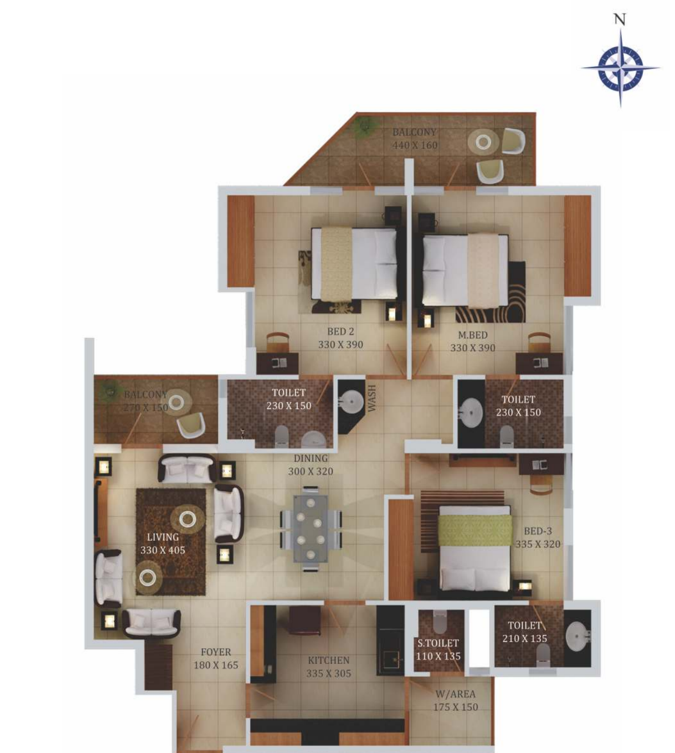
Type D1 , Super builtup area: 1555 sqft.