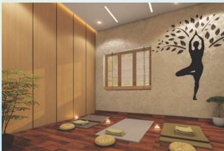
Health Club | Yoga Room | Recreation Hall